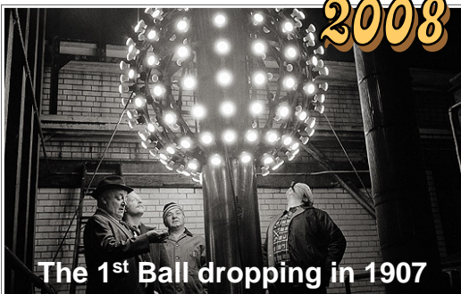
The 1st Ball dropping in 1907