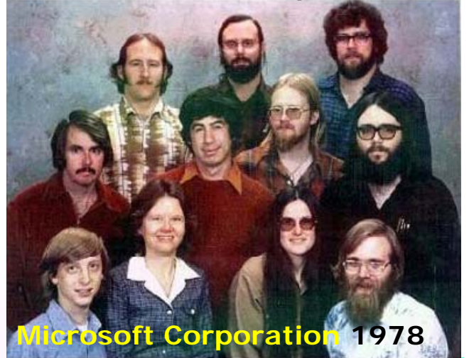
Microsoft Corporation 1978

The offering price of Microsoft stock was $21.00 per share at the IPO on March 13, 1986. If you had bought 1 share at the offering, you would now have 288 split-adjusted shares. So your 21 dollar investment would be worth $7,974.72